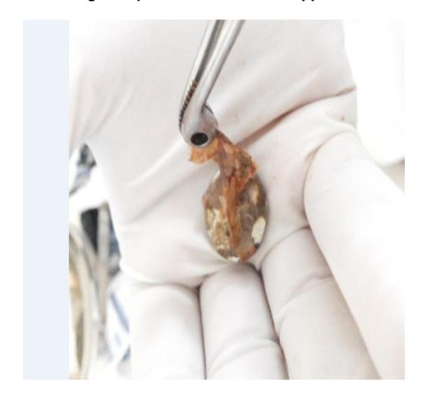
Fig 4: A retrieved coin with Magill's forceps

highest numbers among the ingested FB<sup>8,9,11</sup>. Impacted coin in lower oesophagus if pushed down to stomach my take its own time to be eliminated through stool asymptomatically. Singh et al., express that the FB if larger than 2 cm in diameter are difficult to pass the pylorus<sup>7</sup> therefore pushing management of the object should be done only after assessing the size of the object. Some reviewer opined that the zinc coted coin may have the toxicity effect in human health<sup>2</sup>. Coin impaction in upper part of