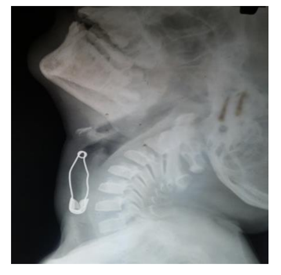
Fig 3: X-Ray image - impacted radio-opaque safety pin